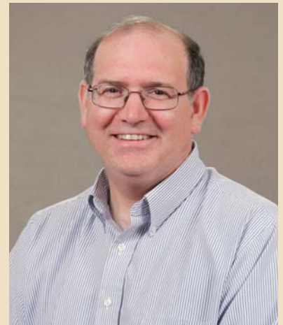
Oblate Walter Linz Temple, TX

“Being an oblate fits into my everyday life by providing me balance, providing me tools to use, to work with others, to bring monastic values, not just for me, but into my community, to strengthen bonds, both at work and at home, and within my parish.”