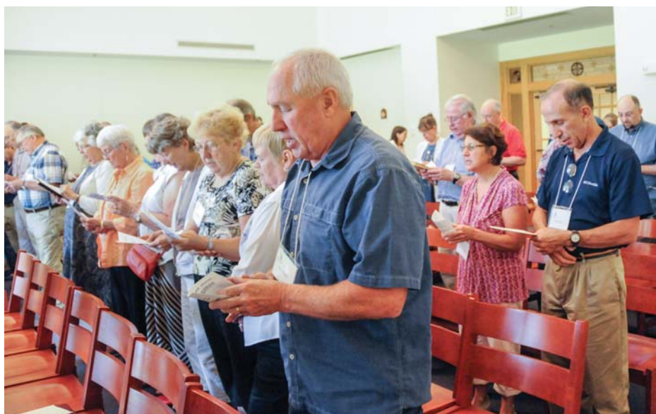
Oblates pray noonday prayer during the Day of Recollection at Saint Meinrad on July 11.