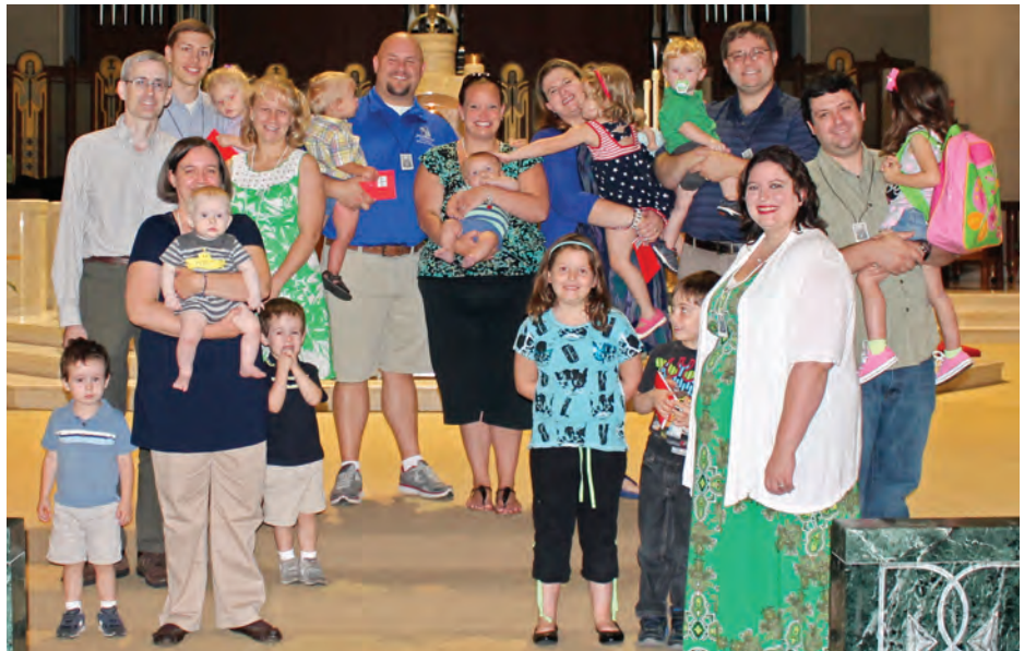
Five couples from Lexington, KY, were invested as oblate novices at Christ the King Cathedral. Their children were present for the ritual. A pitch-in luncheon followed.