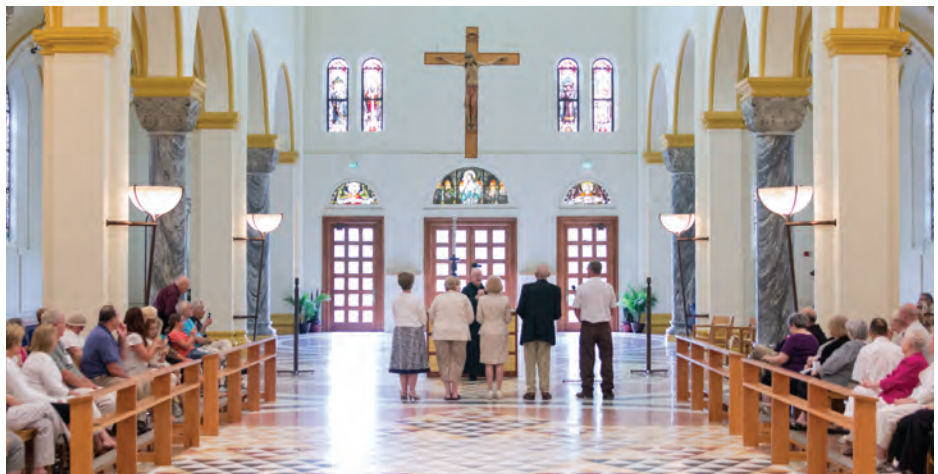
Five oblates receive instructions during the ceremony of oblation in the Archabbey Church on June 10.