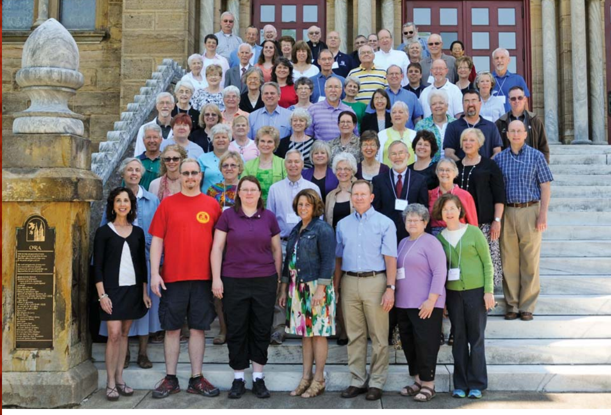
The participants in the 2014 Meeting of Chapter Coordinators and Representatives and Delegates pose for a photo on the Archabbey Church steps on June 15.